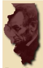
Land of Lincoln