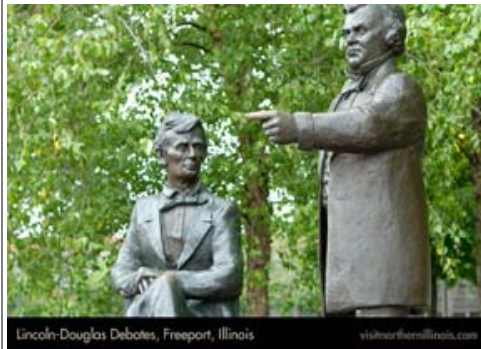
Lincoln-Douglas Debates, Freeport, Illinois

Freeport's 150th anniversary of the famous Lincoln-Douglas Debate will take place with a four-day festival on Labor day weekend, August 29 – September 1, 2008. The grand finale of the celebration will be held on September 1st in beautiful historic Taylor Park on Freeport's East Side near their downtown. Flavor's of Freeport's Lincoln is intended to celebrate the cultural diversity in this small community; both Freeport's "Past, Present and Future" will be showcased in food, music and fun. A wide variety of ethnic cultures will be celebrated with music and food,