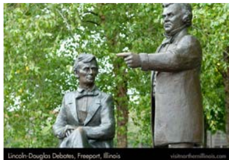
Lincoln-Douglas Debates, Freeport, Illinois

And, make sure you sign-up for the newsletter – you can do so on the website, www.agfun.com . Starting with the next issue (Fall 2008) we will begin distributing an e-newsletter to your email. If you prefer to continue receiving a print version, please send a note to atpi@agfun.com or call (217) 525-7980 and we will ensure it is mailed to you. Otherwise, watch your inbox for the ATPi newsletter this Fall.